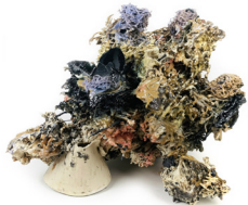
Tammie Rubin, More , 2018, Fired ball moss dipped in pigmented porcelain, underglaze, wire, steel wool, resin, 14" x 14.5" x 14" $3,200