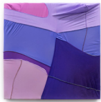
Anthony Olubunmi Akinbola, Untitled, Camouflage Study , 2019, Durags, acrylic on wood panel, 24" x 24" x 3" $4,000