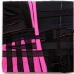
Anthony Olubunmi Akinbola, Untitled, Camouflage Study , 2019, Durags, acrylic on wood panel, 24" x 24" x 3" $4,000