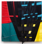
Anthony Olubunmi Akinbola, Untitled, Camouflage Study , 2019, Durags, acrylic on wood panel, 24" x 24" x 3" $4,000