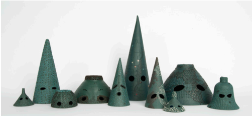
Tammie Rubin, Always & Forever (forever ever ever) No. 6 , (Left), 2021 Slipcast & handbuilt porcelain, underglaze, pigmented clay, $6,500