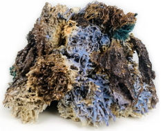
Tammie Rubin, Worshiping , 2018, Fired ball moss dipped in pigmented porcelain, underglaze, wire, steel wool, resin, 12.5" x 16" x 16", $3,600