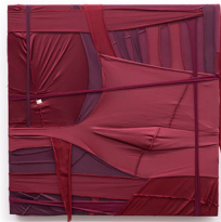
Anthony Olubunmi Akinbola, Untitled, Camouflage Study #071 , 2019, Durags, acrylic on wood panel, 24" x 24" x 3", $4,000