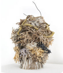
Tammie Rubin, Cruising , 2018, Fired ball moss dipped in pigmented porcelain, underglaze, wire, steel wool, resin, 12" x 9" x 9" $1,800