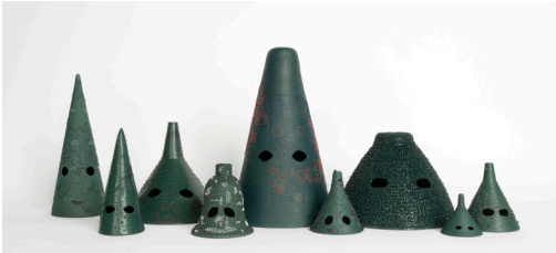
Tammie Rubin, Always & Forever (forever ever ever) No. 7 , (Right), 2021 Slipcast & handbuilt porcelain, underglaze, pigmented clay, $6,500