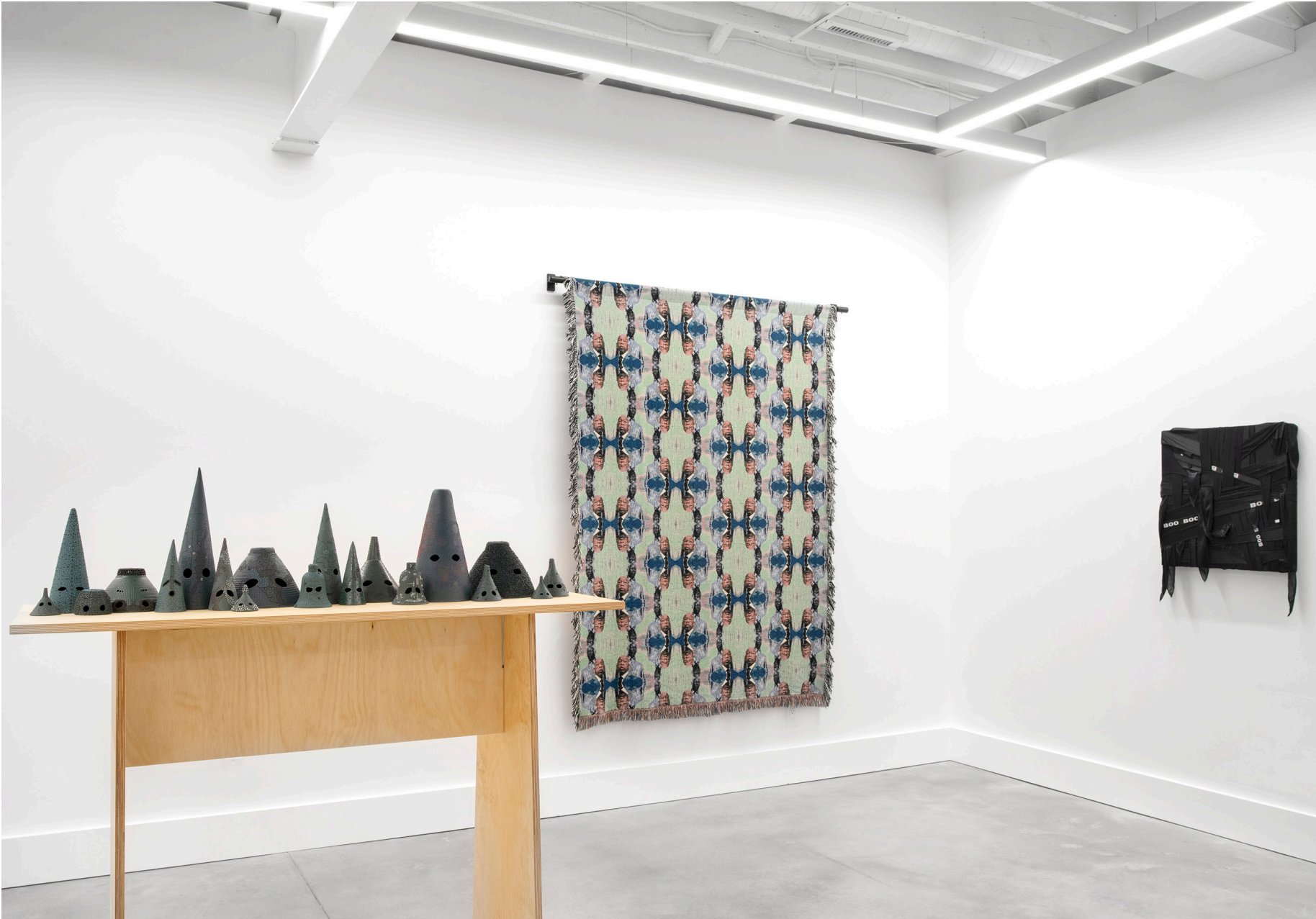
INTERTWINED: AKINBOLA, LOCKE, RUBIN