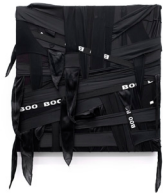
Anthony Olubunmi Akinbola, Untitled, Camouflage Study #088 , 2018, Durags, acrylic on wood panel, 24" x 24" x 3" $4,000