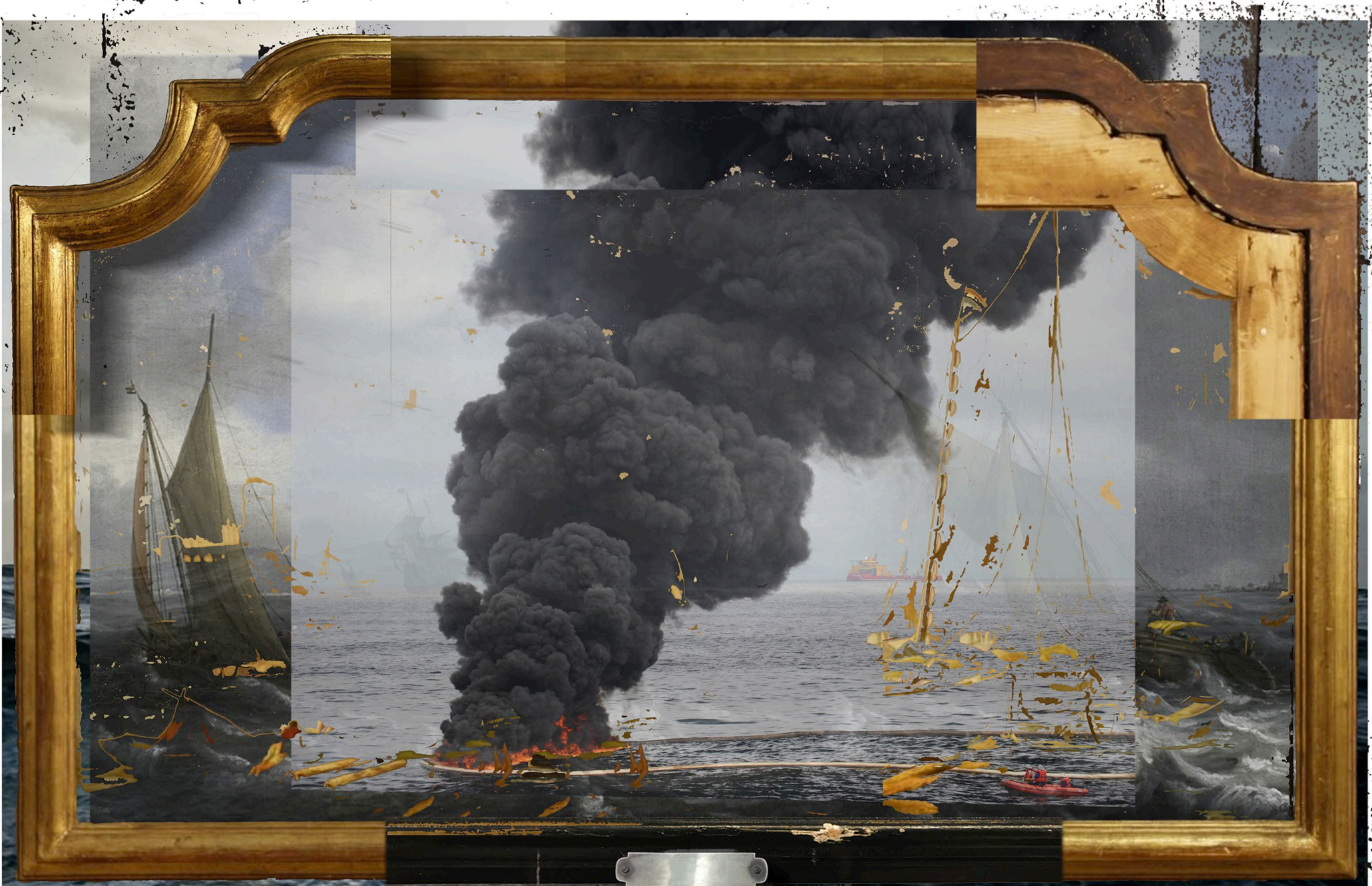
Cover: Deborah Oropallo + Andy Rappaport, Single video still from RECKONING (2020)