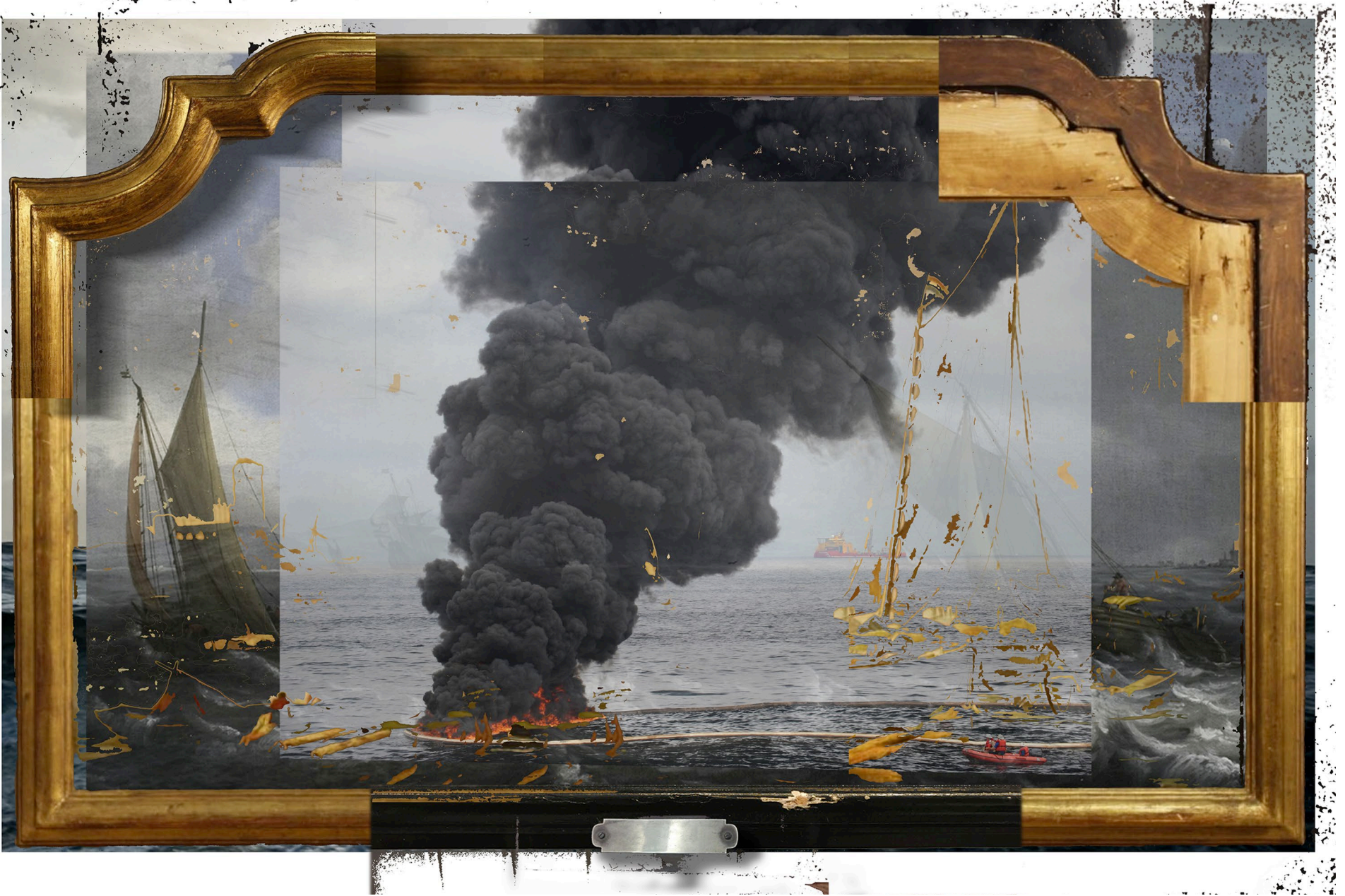
This page: Deborah Oropallo, Video Frame: Oil and Water , 2018, Photomontage on paper, 24 1/2 x 35 3/4 inches, Edition 1/1, $5,000