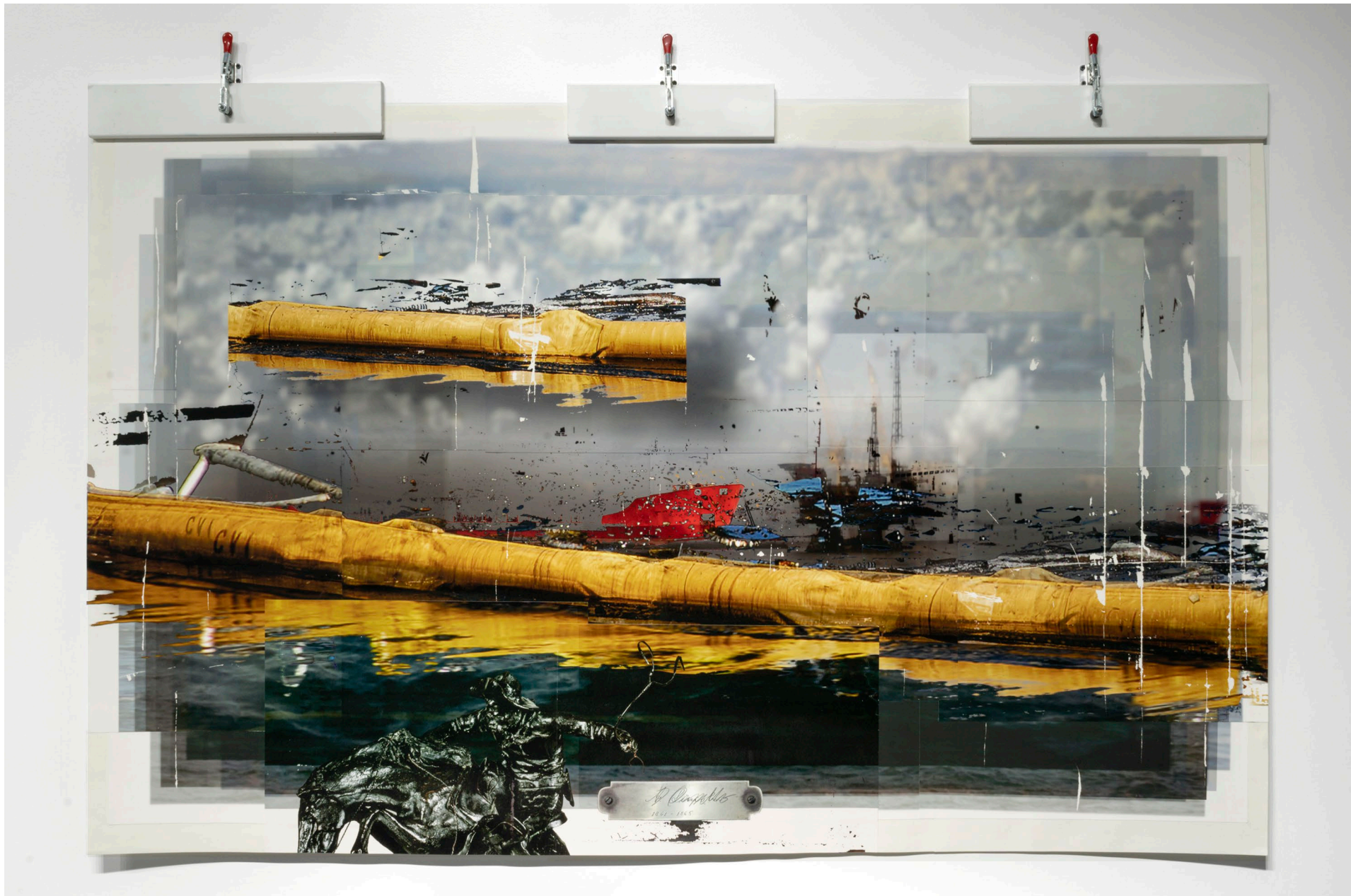
Artwork, left: Deborah Oropallo, Meltdown , 2018, Photomontage, pigment print, paint on paper, 50 x 80 inches, Edition 1/1, $15,000