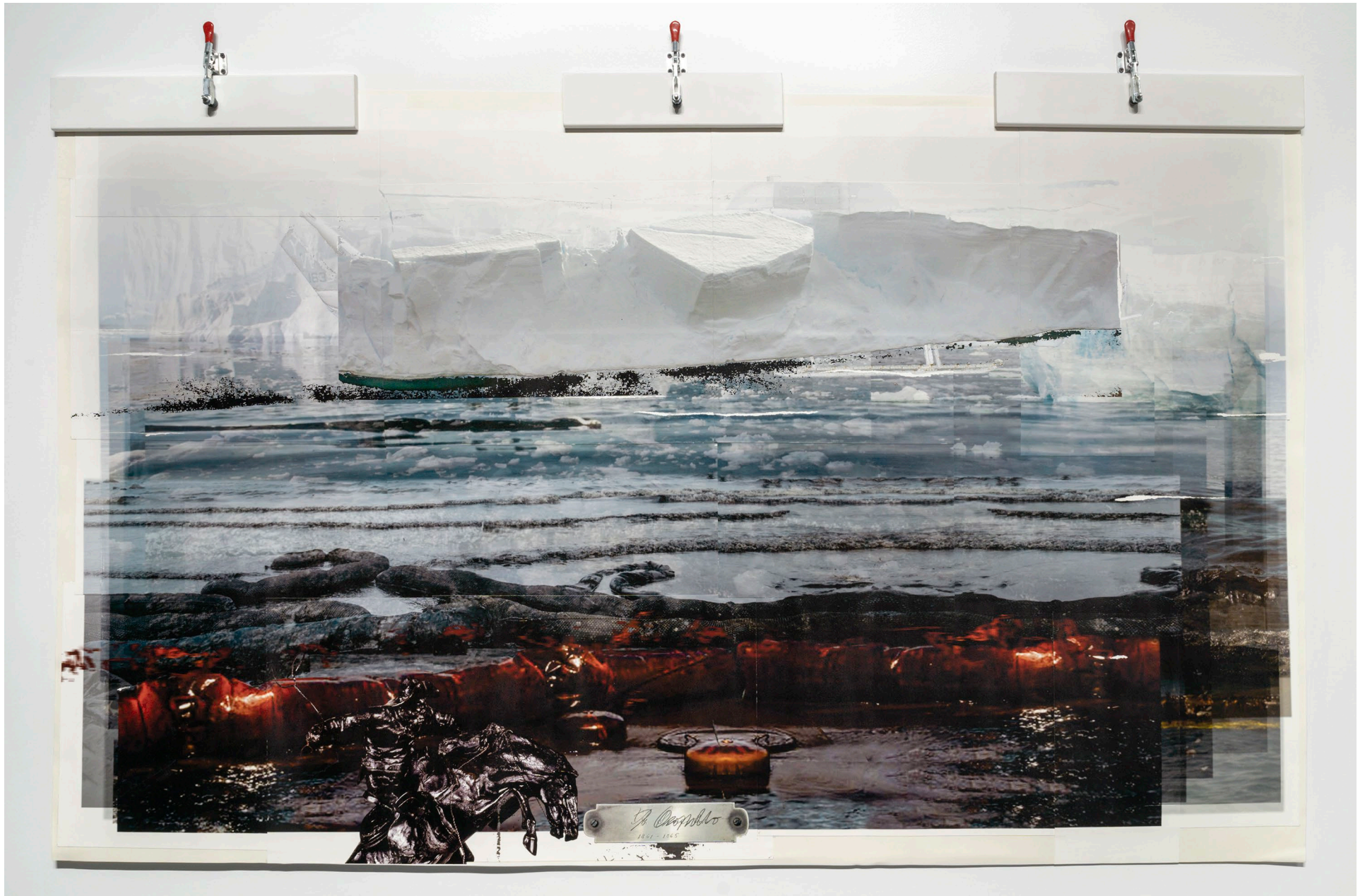
Artwork, left: Deborah Oropallo, Meltdown , 2018, Photomontage, pigment print, paint on paper, 50 x 80 inches, Edition 1/1, $15,000