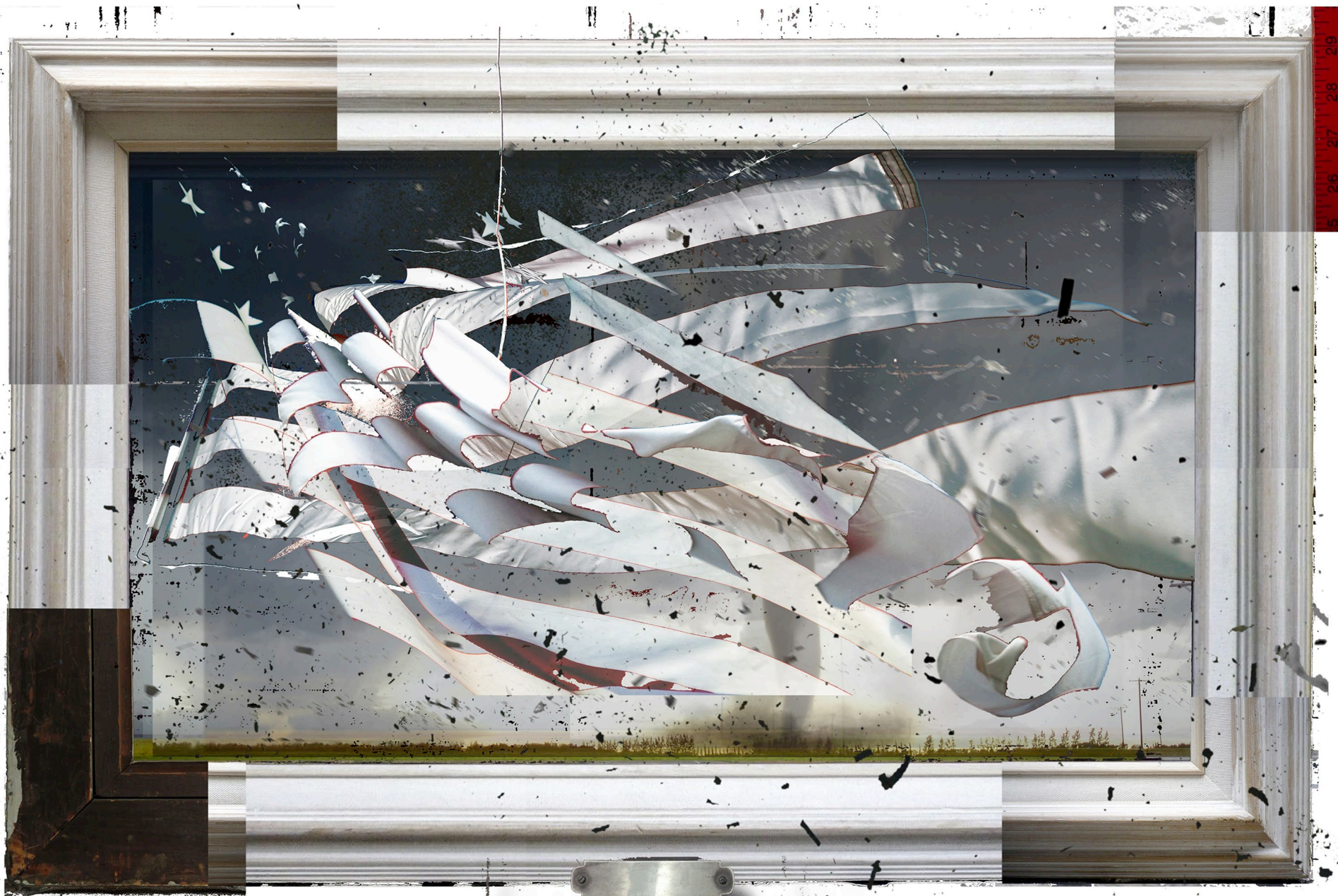
This page: Deborah Oropallo, Video Frame: Tornado , 2018, Photomontage on paper, 24 1/2 x 35 3/4 inches, Edition 1/1, $5,000