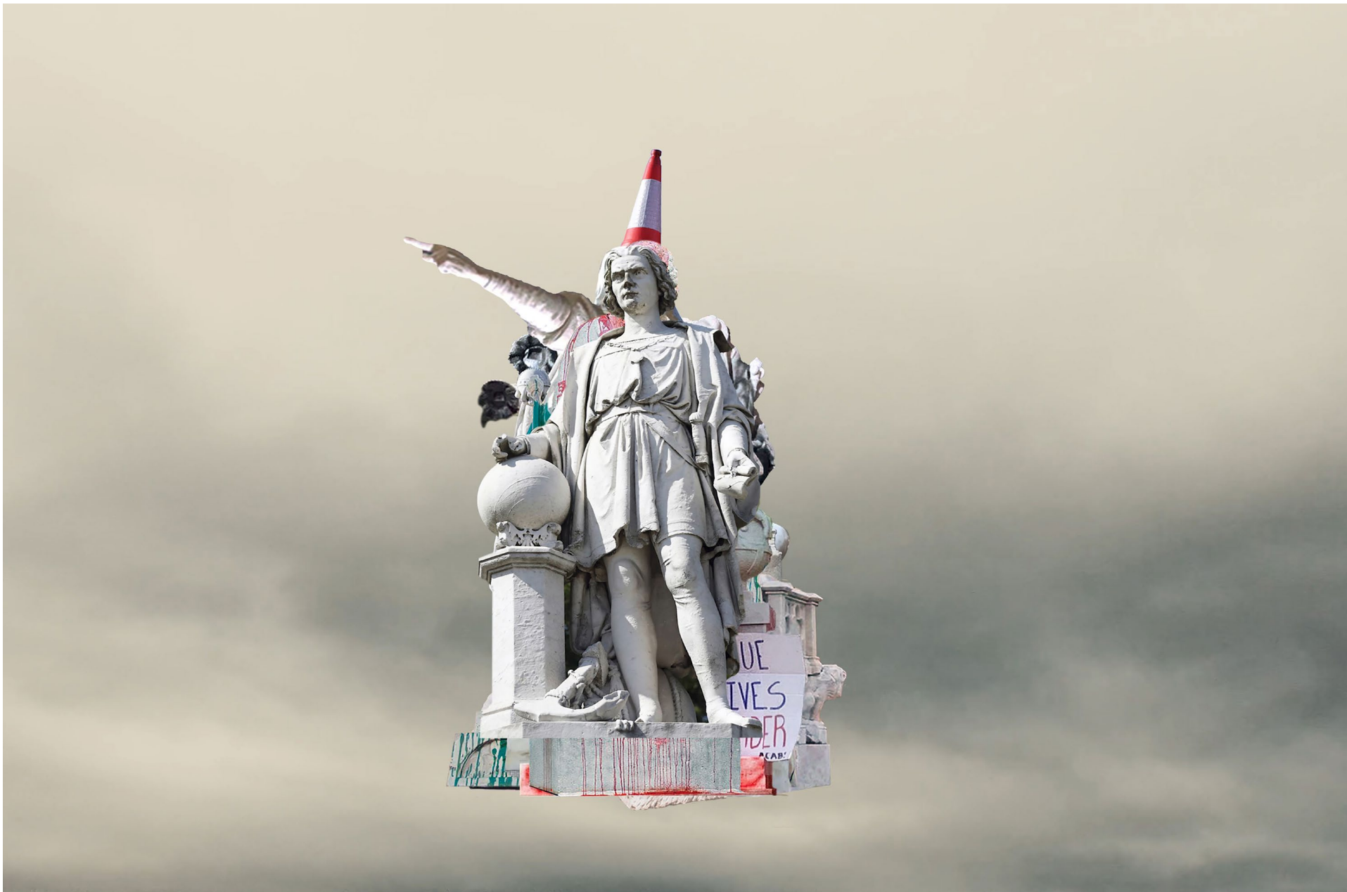
This page: Deborah Oropallo + Andy Rappaport, video still from RECKONING (2020), Single-channel video projection with two-channel sound, Edition of 8 + 3AP, Runtime: 13:32, $9,500